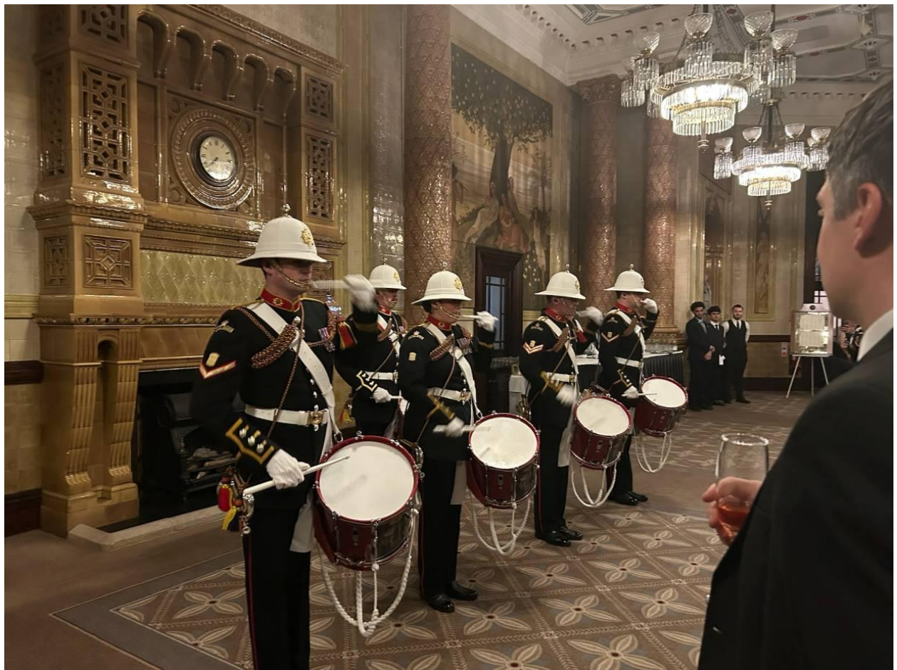
Drummers from the Royal Marines Band