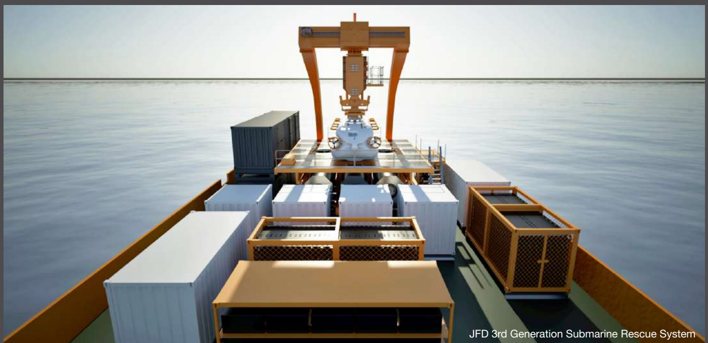
JFD 3rd Generation Submarine Rescue System

to operating doctrines, existing procedures and crewing, and there is no need for extensive training.